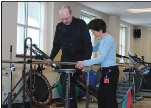
The Sports Medicine and Rehabilitation Center is fully equipped with the latest strength and exercise equipment.

Helping patients reach their maximum potential – that’s the mission of New London Hospital’s Sports Medicine and Rehabilitation Center. The Center provides outpatient and in-patient services and innovative programs at New London Hospital and Newport Health Center that address a wide range of conditions from recovery from a stroke or orthopedic surgery, to treating issues such as pelvic pain and language disorders, to helping an athlete return to his/her sport.