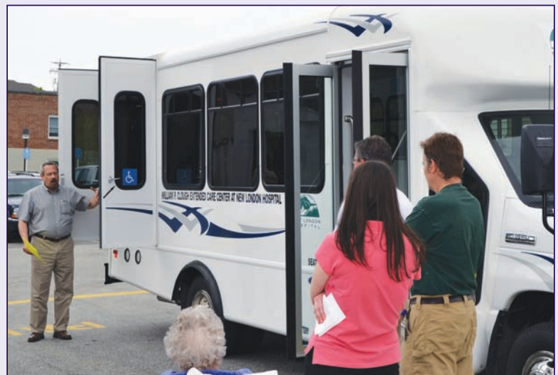
The new Clough Center van arrives!