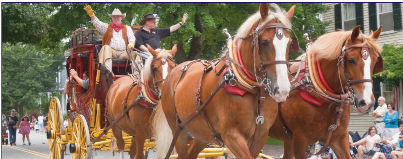
Bring your camera for a photo with the Well's Fargo Stagecoach during Hospital Day